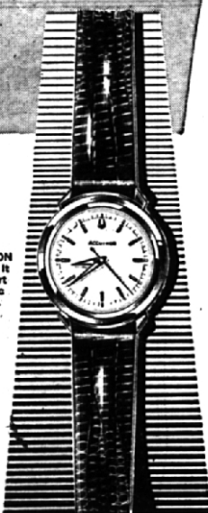
ACCUTRON "205" Hand lapped stainless steel case. Luminous hands and dial. Tapered Alligator strap. (Also with charcoal dial) $100

†For one full year from date of purchase, the authorized jeweler from whom you purchased your ACCUTRON timepiece will adjust it, if necessary, to this tolerance without charge.