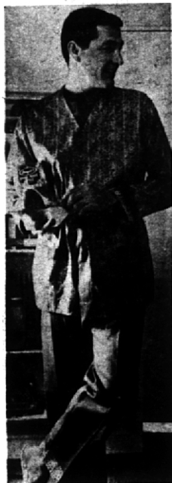
He raids the icebox for a midnight snack, dressed in pajamas with a new light look. The Oriental wrap or kimono is patterned in a batik-type print and has a sewn-in ascot.

It looks as though the American male is due for some very classy relaxing this fall and winter after he latches on to his new pajamas and robes.