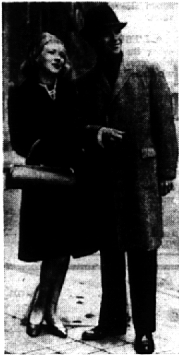
GENTLEMAN'S STYLING for town wear is this medium gray herringbone topcoat. Its tailored shoulder line is accented by the button-through closure, sleeve cuff detailing and flap pockets.

Natural-shoulder fans will show added interest in the updated covert cloths. Wearers of contemporary styles will go for the light gray sharkskin topcoats in suiting weight fabrics, glistening mohair blends and fancy silweaves.