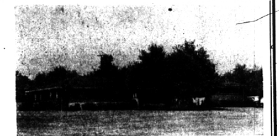
COMFORT AND ENJOYMENT at a modest price in this rambling brick ranch located in a charming orchard setting. 3 bright bedrooms plus an optional 4th bedroom or library, scenic-view living and dining room with fireplace, 2 tile baths, and att. 2 car garage. NEAT AND NICE! $26,750.