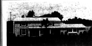
YOU'LL LIKE THIS —Roamy and spacious thruout, and with an unusual split level floor plan, there are 4 excellent bedrooms (including a private master suite), 2 1/2 baths, fun-time family room, basement, and att. 2 car garage. SCENIC FRANKLIN VILLAGE! $29,500.

Handicrafts, carvings, textiles, silver, paintings, stone implements and other items from primitive cultures of Africa, Southeast Asia, Indonesia, the Philippines and Central and South America will be on exhibition Saturday at the Alliance Church, N. Cass Lake Road at M-59, Pontiac. The exhibition is being held in conjunction with the church's annual foreign missionary convention set for Sept. 15 to 22. THE MATERIALS to be shown have come from embassies, missionaries, government trade and tourist bureaus, airline companies and private collections. The exhibit is open to the public; hours are 10 a.m. to 9 p.m. Saturday and from 6:45 to 7:29 p.m. on appointment during the week. DURING THE open house Saturday, among the foreign nationals on hand to answer questions about their countries will be Mr. and Mrs. Hector Bueno. Bueno is associated with Cranbrook School for Boys. Co-chairmen of the exhibit are Mrs. Leland Turner of 6730 Colby Lane, Birmingham, and Mrs. James H. Bersehe of Drayton Plains. They spent two weeks in Washington, D. C., and New York City visiting embassies, government trade and tourist bureaus and other organizations obtaining materials for the show.