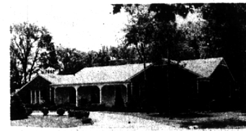
AT THE FIRST GLANCE —You can see the loving care lavished inside and out on this superb Early American Ranch near Oakland Hills. There is an inviting farm kitchen with fireplace and beamed ceiling, formal dining room, 3 twin bedrooms, basement, and att. 2 car garage. FINE! $40,750.