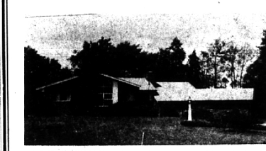
HIDDEN SURPRISE —Directly behind this striking Bi-level is a SPARKLING LAKE for your year 'round enjoyment. Inside are 4 spacious bedrooms, quiet den, a huge 2 area family room, hobby room, 3 full baths, and att. 2 car garage. FUN! $44,800.