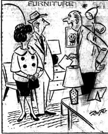
"Have you looked before, or do you wish to be sold from scratch?"