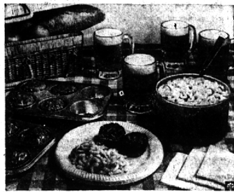
HAM-BEEF MUFFINS SPARK MEAL

Any fine weekend—to enjoy a final summer splurge—is all the excuse you need for a picnic. Picnics are fun when the food is good; make them better by preparing ahead. Ham and beef muffins, tanged with beer or ale are a neat meat trick as you can bake, chill and wrap them in clear plastic