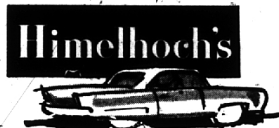
Underground Garage is adjacent to Himelhoch's!

Any purchase at Himelhoch's downtown, during September and October entitles you to 2 hours of free parking at the Grand Circus Park Underground Garage (entrances on Park, Woodward or Adams). Enjoy the many exciting fashion events at Himelhoch's during these 2 months!