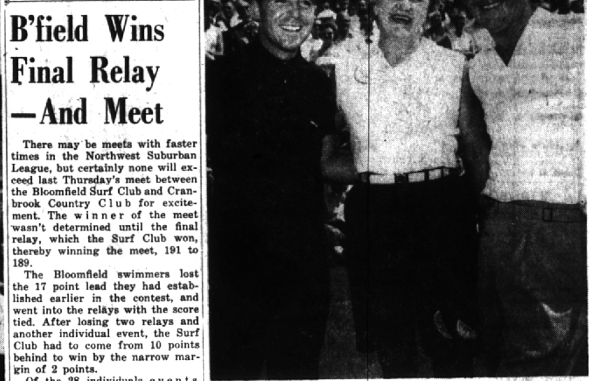
Three at Tee

He previously coached for three years at Greenville (Mich.) High, and one year at Detroit Eastern.