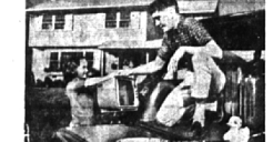
So light and portable it can be carried... safe, secure! G.E.'s new personal portable is easy to use... goes from backyard to garage, from camp to cottage with ease! Don't see any other TV in its home world... or offer! Here it is! Truly portable, and so reliable that it carries a lifetime circuit board guarantee.