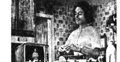
Perfect companion for busy homemakers, G.E.'s personal portable offers about as much table space as a phone book... lets you enjoy TV entertainment while you work in the kitchen, bathroom, bedroom... anywhere! Taps for newspapers too! Now they can watch their favorite programs when and where they want to.

Some see, come buy the light, portable TV that you can enjoy in so many ways... indoors or out!