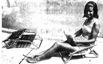
Our new folding Sand Chair

For Beach, Sundeck, or back-yard sun-lovers. Stretch out hard to tan legs and enjoy the open weave Saran webbing. Portable, lightweight aluminum. Aqua, white or green.