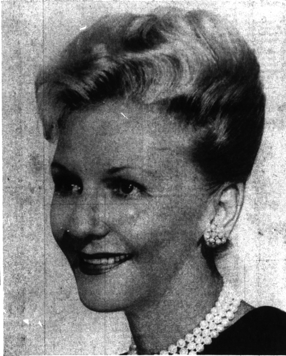
STAR OF THE SHOW MISS MARY MARTIN