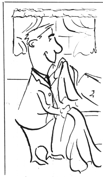
Draperies and Slip Covers