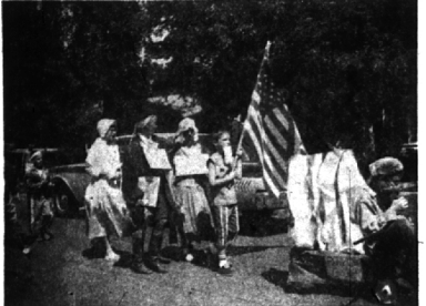
4TH OF JULY PARADERS

THERE WERE "penny diving" events for the five to seven age group, who won blue ribbons, tickets to the Birmingham Theatre and got to keep the pennies. Also, the eight to ten group were awarded blue ribbons and tickets to the Birmingham Theatre.