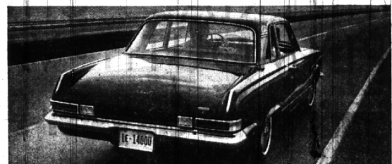
$1910*... Valiant's lowest-priced model...