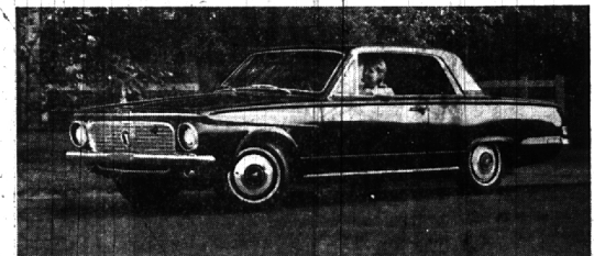
$2230*... America's lowest-priced bucket-seat hardtop...