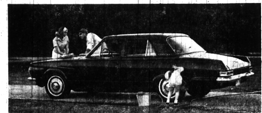
$1973*... Valiant's lowest-priced 4-door sedan...