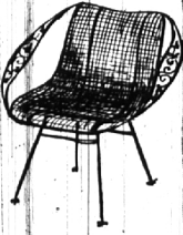
"Ollans" by Woodard $28.95

Woven wire makes these handsome chairs cool, light and extremely comfortable.