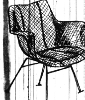
"Sculptura" by Woodard $30.75 available in 3 heights . . . also may be had with seat and back pads.

"WOODARD": lyric lines in a summertime setting. Picture a terrace spattered with sunlight—with this lovely Woodard group as the center of attention. Graceful lines beautifully handled to the smallest detail. ALL PIECES IN STOCK FOR IMMEDIATE DELIVERY in at least one color. . . may be special ordered in a happy choice of 10 summer colors at no extra charge. 8 1/2" rib nylon supported vinyl fully automatic lift, tilt and lower umbrella. Yummy choice of colors $69.77