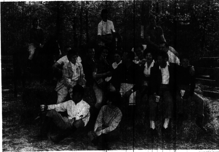
EVERYBODY IN THE ACT