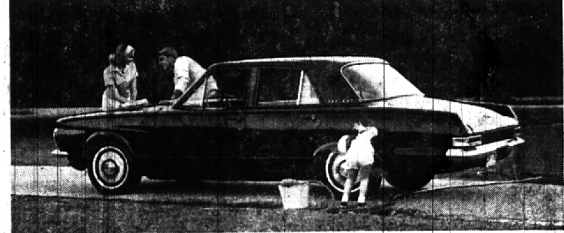
$1973*... Valiant's lowest-priced 4-door sedan...