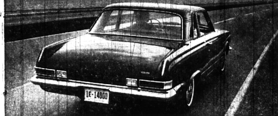
$1910*... Lowest-priced sedan in the line...