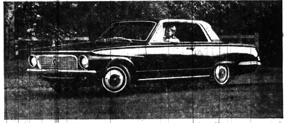
$2250*... America's lowest-priced bucket-seat hardtop...