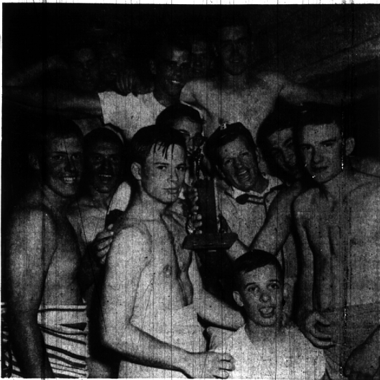
The BARON PLAYERS, the COACH, and the TROPHY Jubilation in the showers after the game.