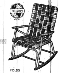
FOLDS IN ONE MOTION