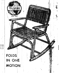
FOLDS IN ONE MOTION