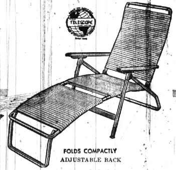
FOLDS COMPACTLY ADJUSTABLE BACK