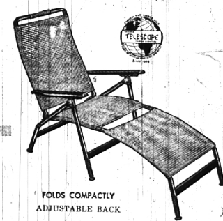
FOLDS COMPACTLY ADJUSTABLE BACK