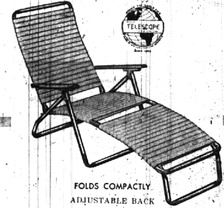
FOLDS COMPACTLY ADJUSTABLE BACK

818 NORTH WOODWARD AT 1 1/2 MILE ROAD OPEN EVERY EVENING TILL 9 P.M.