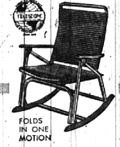
FOLDS IN ONE MOTION