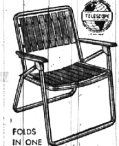
FOLDS IN ONE MOTION