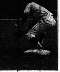
A Cranbrook runner reaches base safely after the Nichols first-sacker dropped the ball. The Craneps defeated the New Yorkers, 1-0.