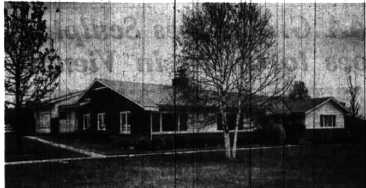
Vacant — Near Oakland Hills

This charming home hosts an excellent floor plan for convenient Family living. "Wife-Saving" Country Kitchen with "Casual-area," dining room, and 3 "twin-sized" bedrooms. Master suite has adjoining full bath. Impressive slate entrance foyer. Partial basement and built-in appliances. Like new carpeting and drapes. Call TODAY — $29,500.