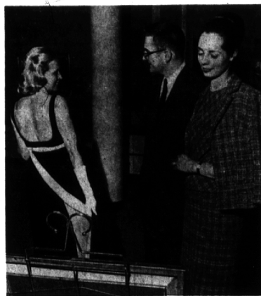
MOMENTARILY DIVIDED INTEREST: