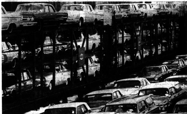
Chrysler Corporation cars are being shipped 'round the clock to meet the needs of our dealers everywhere in supplying the best quality cars we have ever built.