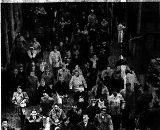
Today in greater Detroit, 60,455 employees are at work in 24 plants building Chrysler Corporation cars and trucks. In 1962, 49,009 were working.