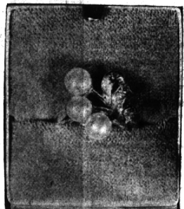
Cultured pearl and diamond ring ..... $70.00