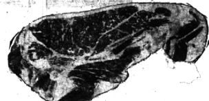
Table trimmed—every bite a mouth watering treat!