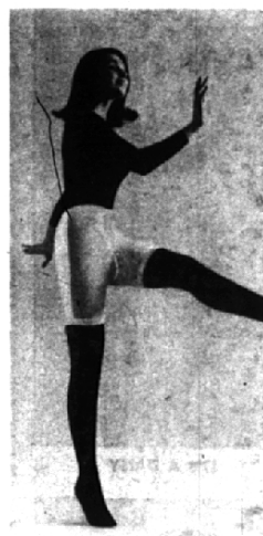
NO RIDING when you stride.

once upon a time little princesses dreamed of wondrous dresses, sweet as sugarplums and gay as fairyland. Jacobson's waved its magic wand: Behold!