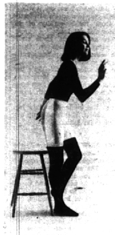
NO TUGGING when you rise . . .