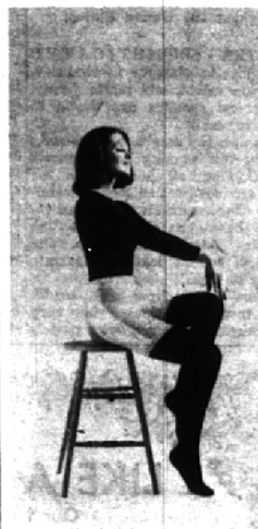
NO BINDING when you sit . . .