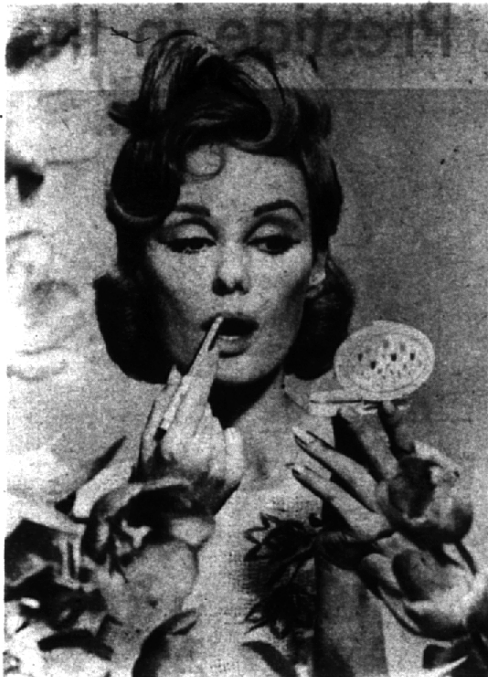
Garden variety comes into its own, as demonstrated by New York model

Suitable for wear on the patio or in the garden is this dainty printed cotton voile. It comes in blue or shrimp and should net its wearer a lot of admiring glances.