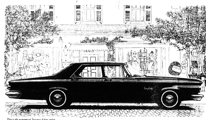
This is the economical Newport 4-door sedan