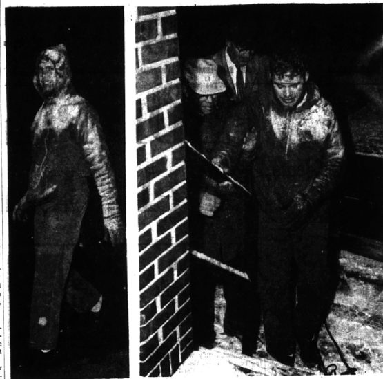
EAST OF THE VIADUCT ALL SEEMED WELL