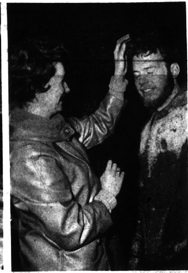
HELP WAS NEEDED AT JOURNEY'S END