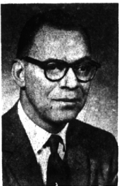
Babe Ruth Head