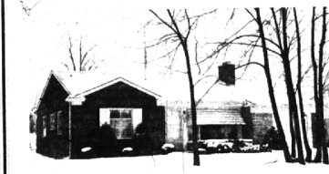
COZY NEST —For the young family just starting married life, this appealing Ranch home is immaculate and well-located. There is a "fun-time" paneled family room, living room with fireplace, 3 nice bedrooms, and attached garage. OUTSTANDING AT THIS PRICE! $16,900.