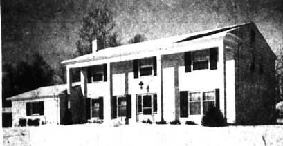
MOVE-RIGHT-IN! Wonderful family home with five bedrooms and large family room with fireplace. Only a year old. Carpeting and draperies included. Near St. Hugo Church and Bloomfield Hills school. One of our best-in the 30's.