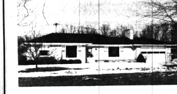
LUXURY LIFE —The discerning buyer who appreciates custom quality, fine location, and careful maintenance, shouldn't miss seeing this impressive brick ranch. With nearly new carpeting and drapes, there are 3 twin bedrooms, formal dining room, 2 glittering tile baths, lux. lavatory recreation room, and attached garage. FINE! $35,900.