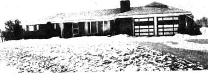
NO "BUTS" ABOUT IT! —Plenty of room (three bedrooms, separate dining room, family room and large screened and glassed porch). Excellent condition. Bloomfield schools. Only $24,800.