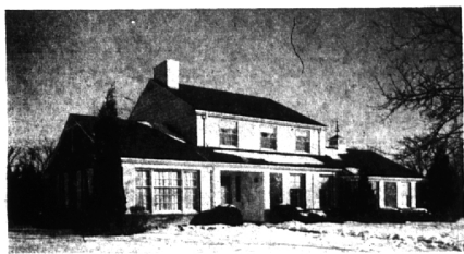
... AND JUST WAIT 'TIL YOU OPEN THE DOOR! It's large (25.6x15) living room, separate dining room and library are just right for modern convenience and entertaining. Three bedrooms, two baths plus two lavs. Recreation room and screened porch. Fully air conditioned for summer comfort. $41,900.00 and in BLOOMFIELD VILLAGE.