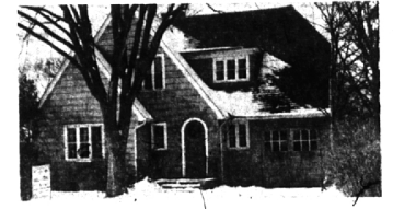
NEAR HOLY NAME —Interesting and spacious older FOUR BEDROOM home on a terraced, wooded site. Large separate dining room, cheery family size kitchen, 2 full baths, basement recreation room, 2 fireplaces, and attached garage. COMFORTABLE AND CONVENIENT! $21,900.