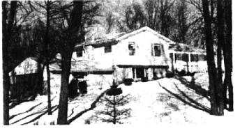
PICTURE BOOK SETTING. With a sweeping view of rolling countryside, this 5 year old tri-level offers room inside and out for an active family. Three excellent bedrooms, huge 23 foot paneled family room with fireplace, large utility-hobby room, basement, and 2 car attached garage. YOUR ANSWER? $30,500.