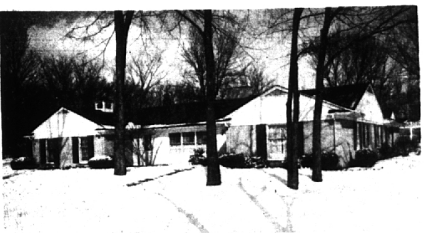
BE GOOD TO YOURSELF—ENJOY LIVING near Oakland Hills Country Club. Three large bedrooms (master suite with dressing room) and three full bathrooms. Fireplace in family room and living room. Screened porch and heated garage. Walk to St. Regis school.