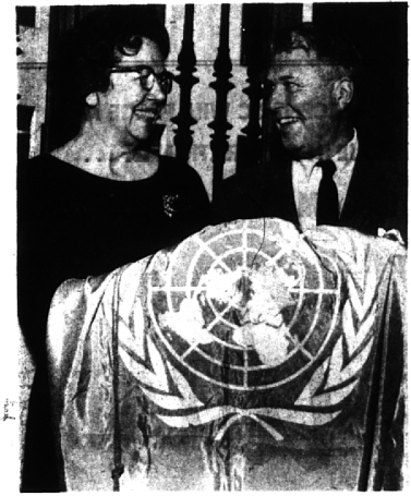
Presenting UN Flag