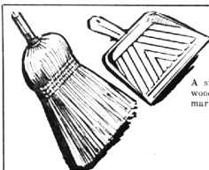
DUST PAN and BROOM

A sturdy broom with a smooth wood handle, and a plastic, non-mar dust pan to go with it.