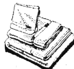
PACIFIC TOWEL SETS

Famous Supersorb Ensemble! Big, thirsty bath towel, matching hand towel and wash cloth. Quantities limited.