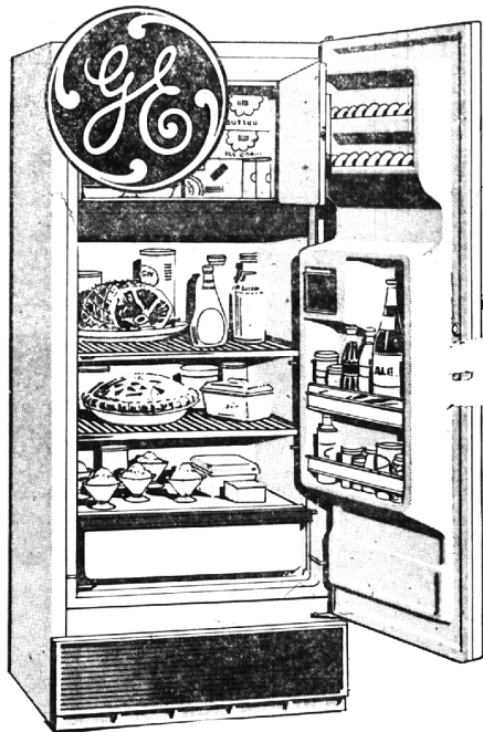
G. E. 12 CUBIC FOOT REFRIGERATOR

Join us this weekend—Thursday, Friday and Saturday, February 21, 22 and 23. You'll be glad you did.