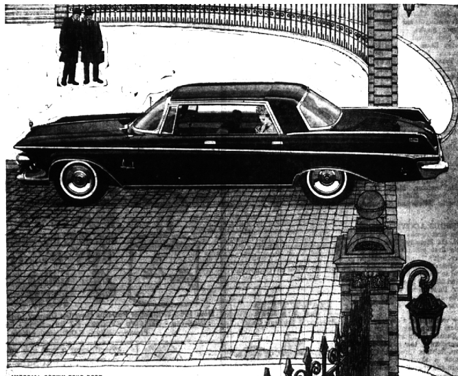
IMPERIAL CROWN FOUR-DOOR

OPEN: Monday-Thursday... 9:30 A.M. to 4 P.M. Fridays... 9:30 to 6 P.M. Saturdays... 9 to Noon. Member F.D.I.C. and Federal Reserve System