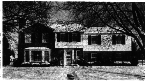
"IT'S FOR YOU, MY LOVE"—IN BLOOMFIELD VILLAGE Four twin size bedrooms. Large living room and dining room, each with bay. Family room AND library. Quick possession, $42,500.