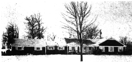
SEE-AT-A-GLANCE, LOTS OF ROOM! Four twin size bedrooms, dining room AND paneled library. Recreation room in BASEMENT. 20 x 12 screened porch. 11 CLOSETS! Lake privileges.