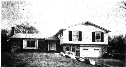
OVER AN ACRE AND RIGHT IN TOWN! Excellent floor plan in this nearly new quality quad-level. 5 bedrooms, 3 1/2 baths, family room, separate dining room, 2 fireplaces. The extras include underground sprinklers, 2 patios and extensive landscaping.