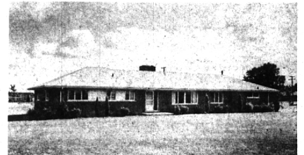
A WEALTH OF SPACE —Three large bedrooms. Fireplace in living room as well as in Family room. Oceans of closet space. Carpeting, draperies and built-in oven and range. Near school. Easy financing, $29,900.