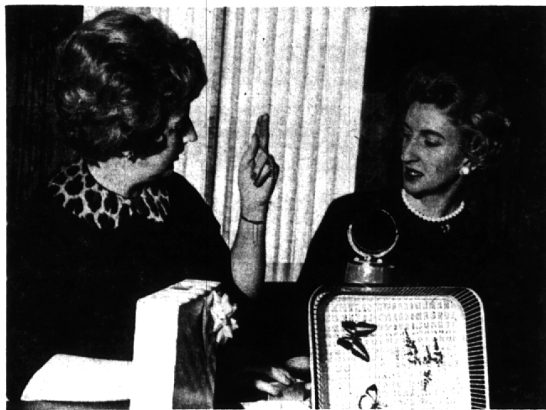
They're Collecting Valentines