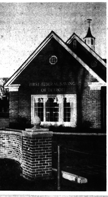
FIRST FEDERAL SAVINGS OF DETROIT