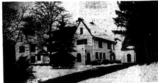
BLOOMFIELD HILLS EXECUTIVE MANSION

BLOOMFIELD VILLAGE — French provincial with 5 bedrooms that are really BIG. 4 baths • Lav • Dining room • Family room • Recreation room • Glassed porch • Great closets and storage space • Superb condition, A pleasure to show. $62,500.