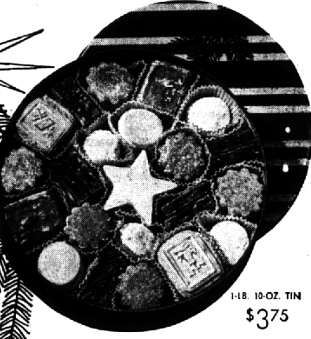
Christmas Star Cookie Box 1 1/2 10-OZ. TIN $3.75