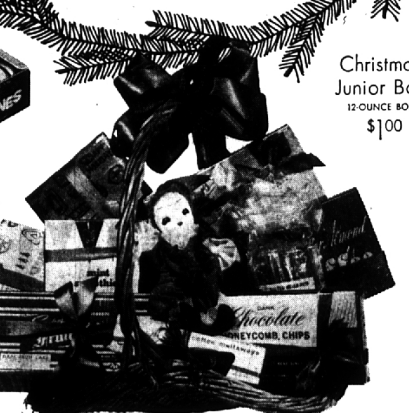
Chocolate Peppermint Chips 1 1/2 4 OZ. TIN $1.95

Executive Gift Baskets FROM $10 Wonderful assortments of his favorite good things—packed in beautiful gift baskets.