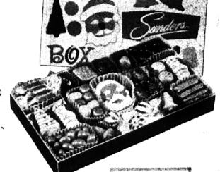
Junior Cookie Box 12 OUNCE BOX $1.00