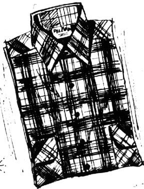
Pendleton virgin wool sport shirts from 14.95

100% virgin wool Pendleton robes assure you the highest quality. Muted plaid pattern for 'his' taste. Styled along classic lines for a long fashion life.