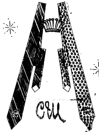
Countess Mara ties from 7.50

Young's Distinctive Gift Boxes Are Unique And Make A Beautiful Gift In Themselves