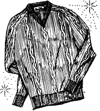
Alan Paine sweaters soft, bulky, shetland wool 19.95

Full fashion styling sets this Alan Paine apart from the ordinary. Raglan shoulders for a smooth line; unusual cable knit design; V-neck slip-over comfort. A host of colors for holiday giving.