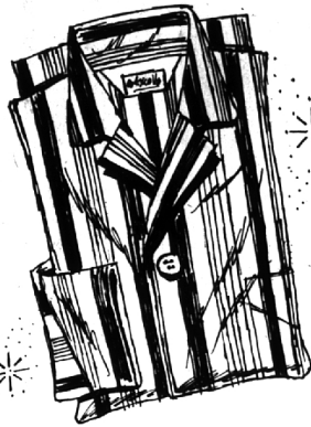
Excello pajamas imported fabric from 8.95

Gifts he would choose himself... come from Young's of Birmingham