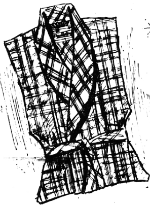
Pendleton robes 25.95

Full fashion styling sets this Alan Paine apart from the ordinary. Raglan shoulders for a smooth line; unusual cable knit design; V-neck slip-over comfort. A host of colors for holiday giving.