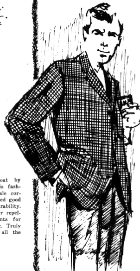
SPORT COAT 65.00

The Club Coat by ZERO KING is fashioned of pinwale corduroy for rugged good looks and wearability. Wind and water repellent. Side vents for ease of walking. Truly a man's coat all the way.