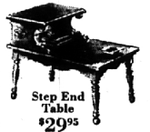
Step End Table $29 95

Don't hesitate . . . now is the time to shop and save on Old Colony living room tables! These have an authentic Early American flavor, and are made of hand-polished, solid hard rock maple in lovely Cinnamon finish. Here is an ideal family gift!