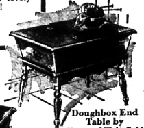
Doughbox End Table by Heywood Wakefield $39 95