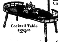
Cocktail Table $29 95