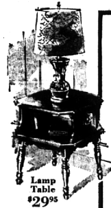
Lamp Table $29 95

Salem Maple . . . . . $29 95 Black/Gold . . . . . $34 95