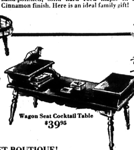
Wagon Seat Cocktail Table $39 95