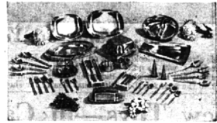
GENSE 18-8 "Eterna" Stainless Tableware