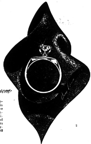
Solitaire by Orange Blossom

Designed to meet the rigorous demands of time in the jet age, this fine watch mechanism is the newest development in more than three centuries. We'd like to tell you about Accutron and show you its remarkable performance. Pictured is Accutron "208" in yellow or white with custom crafted case. $175