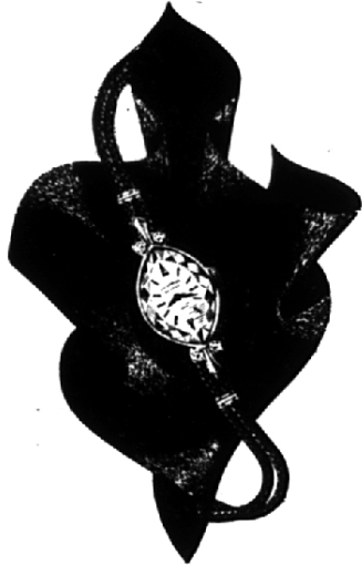
Sparkling Marquise by Universal Geneve

Change your outmoded ring to a showpiece by having it reset in this Ballarina mounting. A bevy of baguettes and a circle of brilliants form the tutu skirting the loveliness of your own center stone, giving you a beautiful ring at a fraction of its value, and for compliments it's S.R.O.! Mounting in platinum $1600