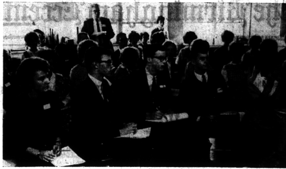
THESE STUDENTS from Marian and Brother Rice High Schools may look concerned, and with good reason. They were participating in Marian's second annual model United Nations and were deciding such issues as the Representation of Red China, Race Relations in South Africa, the Repatriation of Palestine Refugees and a white paper on Malaysia. The comprehensive conference was attended by 177 delegates and secretariat members.