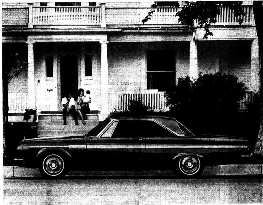
Fury 2-Door Hardtop