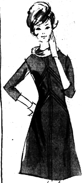
Bright, Misty Wool Junior Dress 17.98