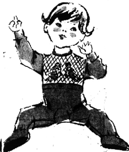
"Carter's" Cozy Print Cotton Sleepers 3.50

Trend-setting basket weave wool dress with skimmer fit, smart seaming, and a soft smocking chiffon scarf to frame a pretty face. Blue or spice-pink, sizes 6-15. Junior Dresses—Second Level