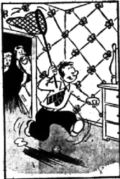
"You shouldn't have rented this room to a butterfly collector!"