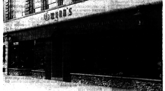
THE OUTSIDE OF Gwynn's men's store on S. Woodward has been entirely remodeled along with the interior. The project has more than doubled Gwynn's merchandising space. The store has been at location for nine years.