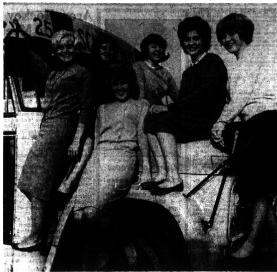
Bloomfield Queen and Her Court

The Council will have a double function: generally it will act as a disciplinary committee, revising rules and judging minor violations; also it will act as a student voice to the faculty, representing student opinion and presenting any proposed changes in policy.