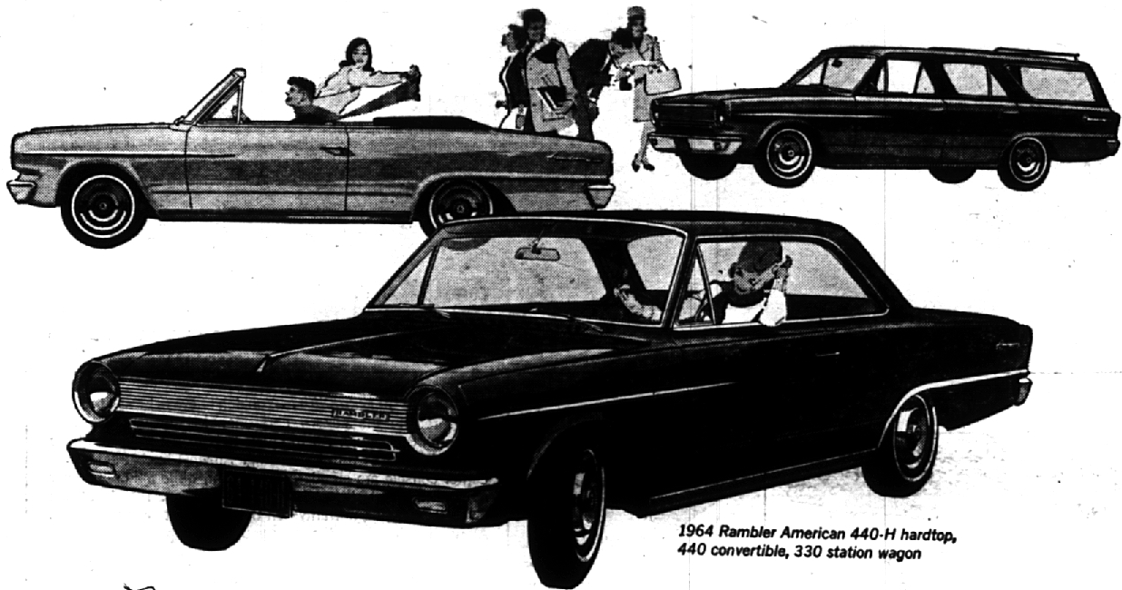
1964 Rambler American 440-H hardtop, 440 convertible, 330 station wagon