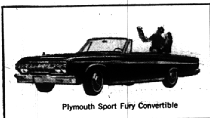
Plymouth Sport Fury Convertible