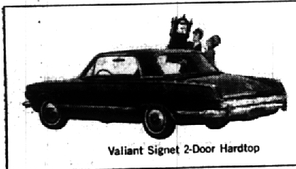
Valiant Signet 2-Door Hardtop

'64 Plymouth and Valiant shift into high...with the year's sportiest new cars. Soft-tops, hardtops...bucket seats...four-on-the-floor sticks...engines that go all the way up.