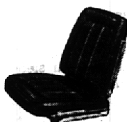
All-Vinyl Bucket Seats.

VALIANT/64 STYLE—BEST ALL-AROUND COMPACT —People who know the low-price compacts will tell you that Valiant has always packed a little extra punch. Valiant/64 style is no exception. Equipped with the optional 225-cu.-in. "six," Valiant will leave most compacts standing still. Valiant's got more charm than compacts are supposed to have, too. On the Signet convertible below, for instance, all-vinyl bucket seats are standard equipment. Valiant also carries a 5-year/50,000-mile warranty* on the engine and drive train. See your nearby dealer now.